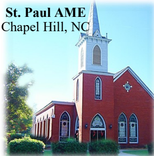
St. Paul AME Chapel Hill, NC

Proceeds will benefit St. Paul Village, a mixed-use development and community resource in the Rogers Road neighborhood.