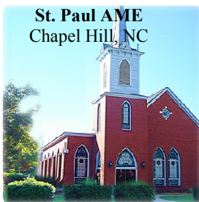
St. Paul AME Chapel Hill, NC